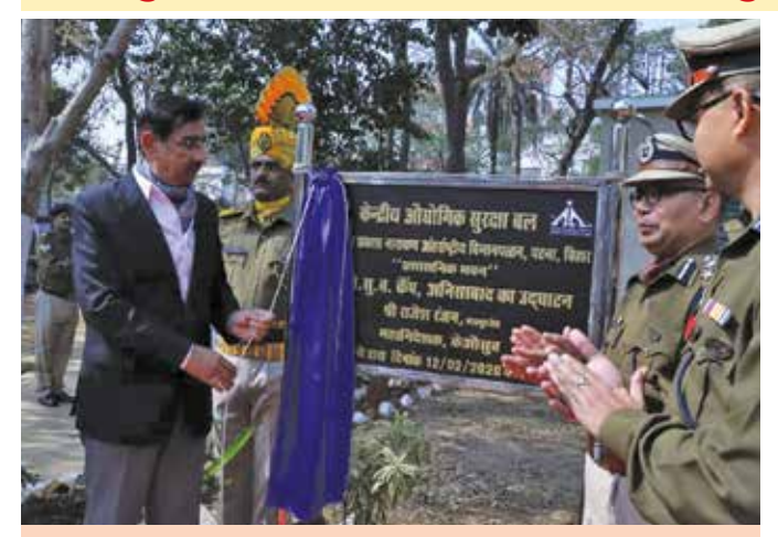
Shri Rajesh Ranjan, DG, CISF inaugurating the administrative building

To check security arrangements and operational preparedness, Shri Rajesh Ranjan, DG, CISF visited at CISF Unit, Patna Airport on 12.02.2020. During the visit, he inaugurated administrative building at Unit Line.