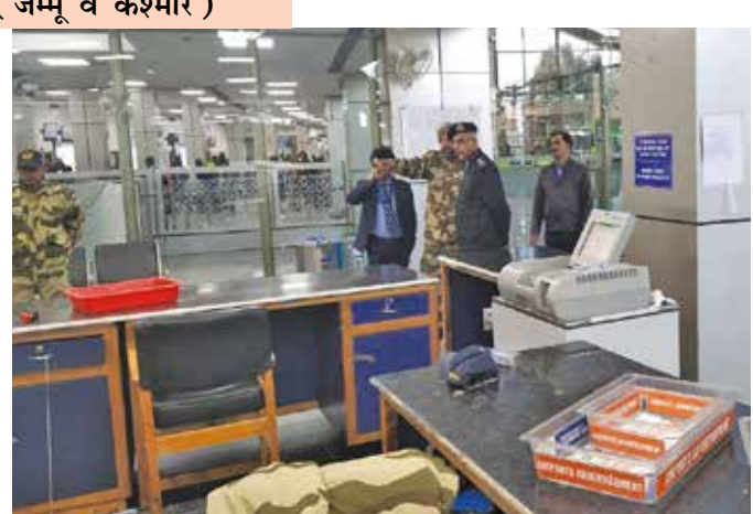
जम्मू एयरपोर्ट ( जम्मू व कश्मीर )