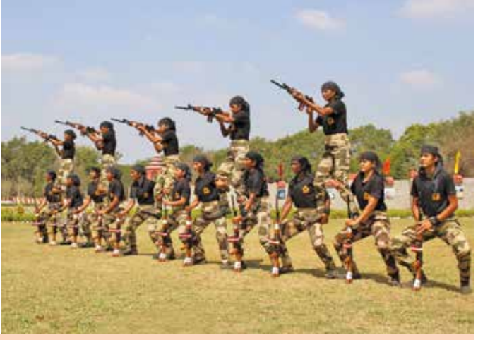
Gymnastic and co-ordinated fire demonstrations by daredevils of CISF