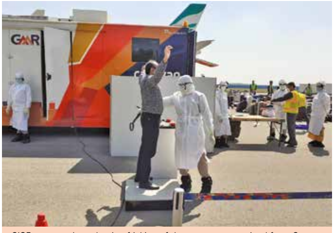
CISF personnel conducting frisking of the passengers arrived from Corona affected countries under the open sky at air side of IGI Airport, New Delhi

This deployment is beyond the mandated duty of CISF to extend the help to the arriving passengers and officials for smooth mandatory medical check up etc. CISF personnel also contributed in controlling the worried passengers and kept them at ease, as most of the passengers arrived from Corona affected countries were tensed.