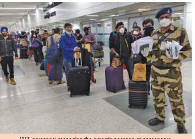
CISF personnel managing the smooth passage of passengers at IGI Airport, New Delhi