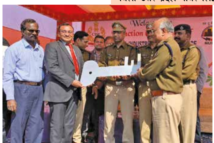
नैवेली उत्तर प्रदेश पॉवर लि0 घाटमपुर, कानपुर (यु0पी0)