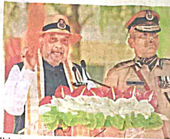
Union home minister Amit Shah speaks at the 54th CISF Raising Day parade 2023 at the National Industrial Security Academy in Hakimpet on Sunday.

■ Page 2: Shah elated at CISF fete in glorious city