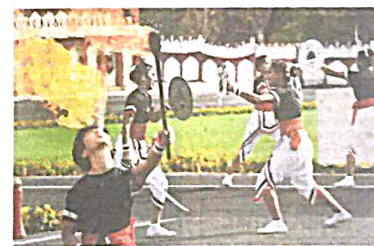
(Clockwise from top left) Union Home Minister Amit Shah reviewing the ceremonial parade during the 54th CISF Raising Day celebrations at the National Industrial Security Academy in Hakimpet, on Sunday; CISF personnel performing anti-terrorist drills on the occasion; and women personnel of CISF performing Kalaripayattu, an indigenous martial art form as part of the parade.