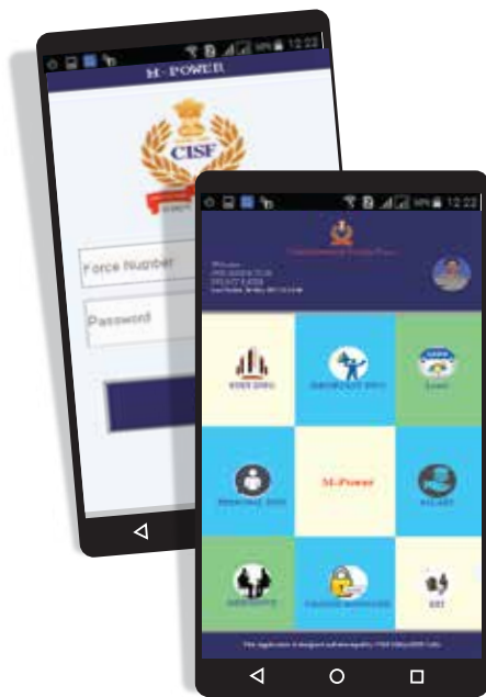
M-Power Mobile App

concept has been successfully tested using a working prototype developed by the CISF.